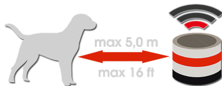
Indoor maximum range