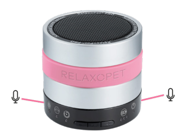
Please do not cover the two highly sensitive microphones on the RelaxoPet® PRO sound module!

Note that you should only use NOISE-MOTION when your pet is at home alone. Switch off extraneous noises (such as TV / radio) as this can lead to malfunctions.